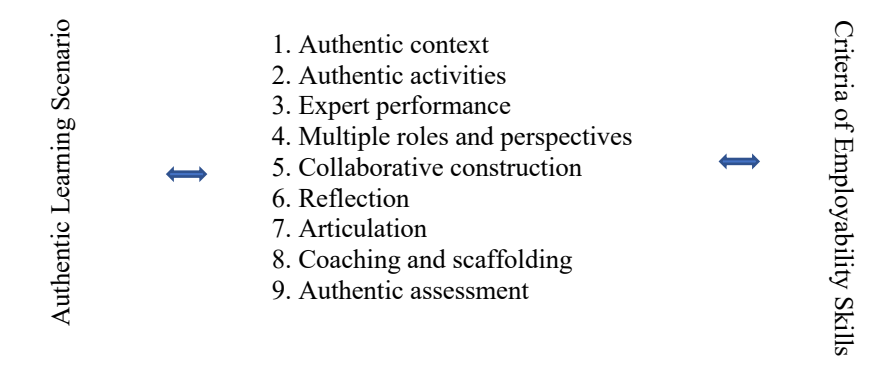
Table 2 The Nine Characteristics of Authentic Learning (Herrington et al., 2010)

To promote reflection (Element Six), the task includes decision-making, e.g., where to start the norm-critical guidance work, what workplace documents the students should use or build on, as well as what kind of theories they should use.